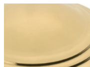
Polished Brass (PBU)