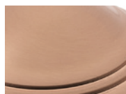
Satin Copper Lacquered (SK)