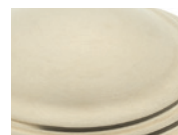
Satin Nickel (SN)