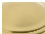
Satin Brass (SBU)