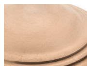
Satin Copper (SKU)