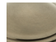
Satin Nickel Bronzed (SNB)