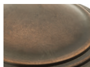
Chestnut Bronze (CHB)