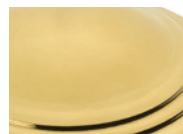
Polished Brass Lacquered (PB)