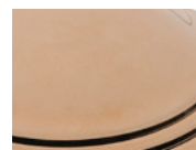
Rose Gold (GRS)

IMPORTANT - Due to the restrictions within the printing process product appearances may vary to the images shown within this brochure. Actual swatch samples are available upon request.