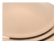
Polished Copper (PKU)