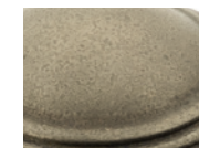
Antique Nickel Distressed (AND)