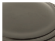
Dark Matt Bronze (DMB)