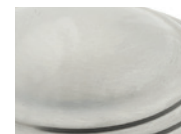
Satin Chrome (SC)