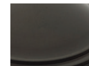
Matt Black Chrome (MBC)