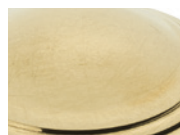
Hand Burnished Brass (HBB)