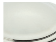
Polished Chrome (PC)