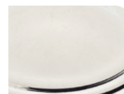
Polished Silver (SP)