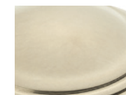
Hand Burnished Nickel (HBN)