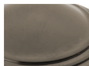
Imperial Brass (IBU)