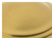
Satin Brass Lacquered (SB)