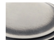
Antique Silver (AS)