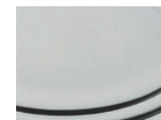
Pearl Chrome (PRC)