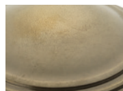
Antique Brass (ABU)