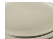
Pearl Nickel (PRL)