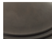
Matt Black Nickel (MBN)