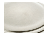
Butlers Silver (BS)