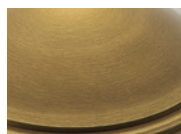
Antique Brass Lacquered (AB)