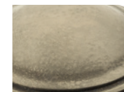
Antique Nickel (AN)