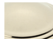
Polished Nickel (PN)