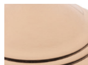
Polished Copper Lacquered (PK)