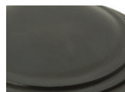
Ebony Bronze (EBB)

Colour and texture variation is inherent in the creation of hand finished patinas and once installed, touch, time and environment should lead to gradual wear and oxidization, lending character and elegance.